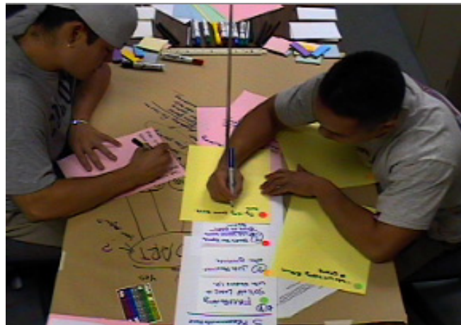
Figure 4: Placement—the participant on the right is adding to the conclusions, while his partner is starting a new topic.

More interestingly, participants positioned objects between themselves so as to mediate access. Individual contributions were consistently made with the object close to the writer. A standard pattern was for the writer to position a card close to his or herself, write a contribution, and then move the