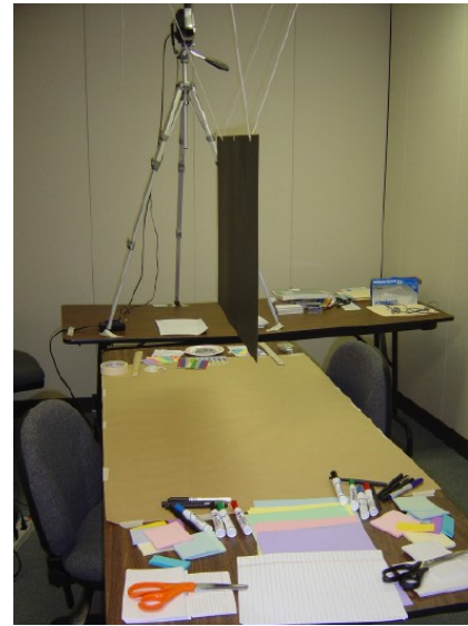
Figure 1: Study Environment

The video data was analyzed in multiple passes. We approached the video with no predefined theory or system, and made every effort to let the data guide the analysis. A custom application was developed to support variable